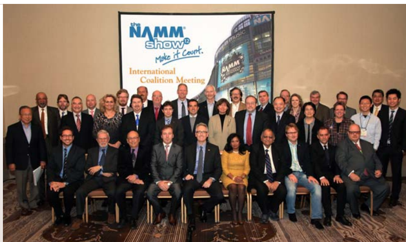
International Coalition Meeting Delegates.